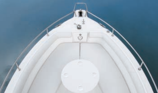
Relax around the entertainment table on plush bow cushions that conceal twin insulated storage boxes.