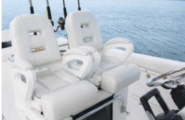
Command in comfort and style from these optional bolster chairs.