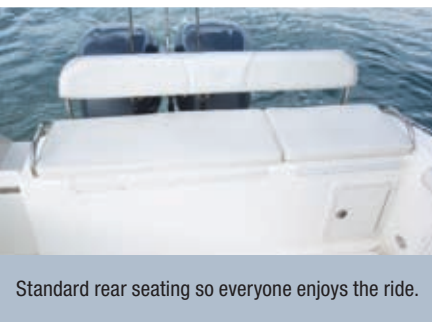
Standard rear seating so everyone enjoys the ride.