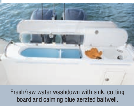
Fresh/raw water washdown with sink, cutting board and calming blue aerated baitwell.