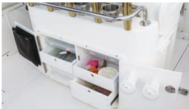
Optional tackle center with trays and drawers for tackle and accessories.