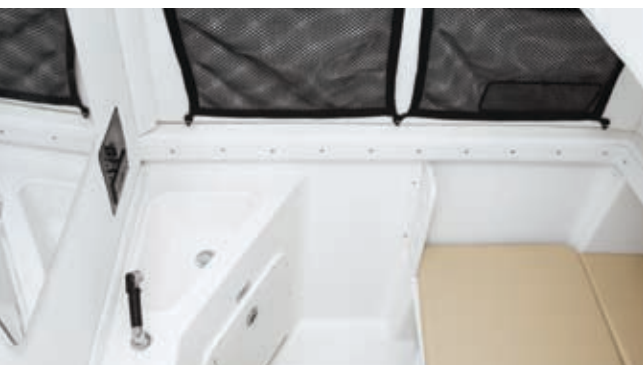
Electric head with holding tank and sink, plus additional rod storage.