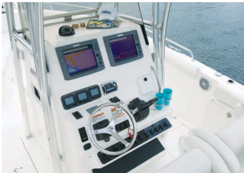
Ergonomically designed helm ready for flush mounted electronics with lockable glove box and standard Yamaha Command Link® gauges. (Shown here with optional dual Raymarine® E120s)