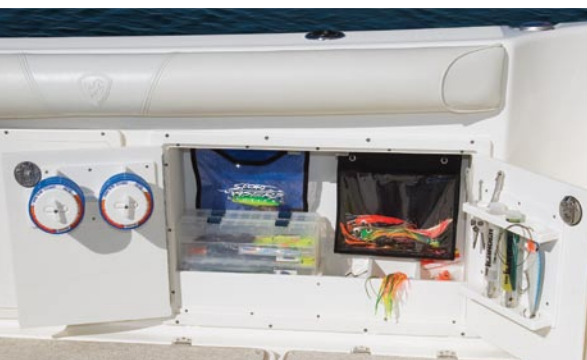
Tackle center with hanging tackle bag, (2) leader wheel holders, (2) tackle trays, (3) floor storage compartments and (3) lure tubes.