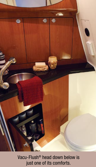
Vacu-Flush® head down below is just one of its comforts.