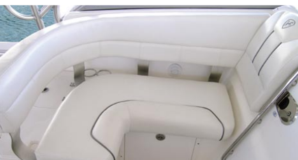
Wrap-around lounge seating with stainless steel back supports, 360-degree air conditioning vent, stainless steel cup holders, (2) large drawer storage units w/ stainless steel latches and slides.