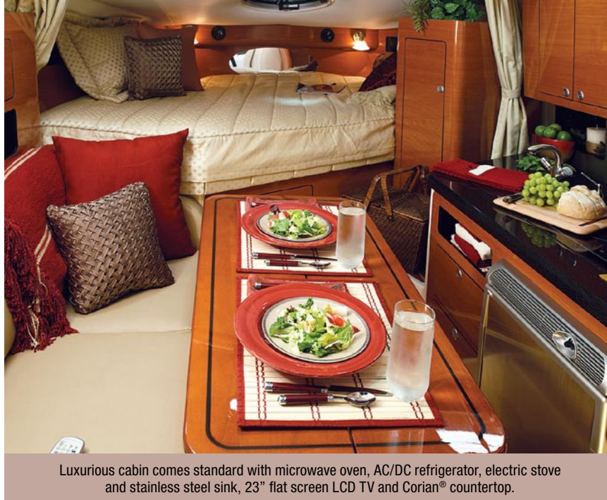
Luxurious cabin comes standard with microwave oven, AC/DC refrigerator, electric stove and stainless steel sink, 23" flat screen LCD TV and Corian® countertop.