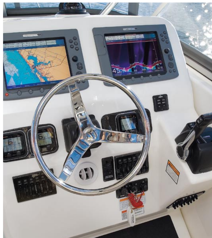
Helm is packed with features like flush mounted electronics (shown here with optional dual Raymarine® E120s), trim tab switches, Yamaha Command Link® gauges, tilt steering, A/C vent, watertight stereo and MP3 player storage box.